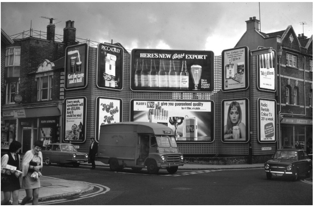
The corner of Falcon Street and St Nicholas Street, 1966: vehicles, hoardings and hemlines from nearly fifty years ago.