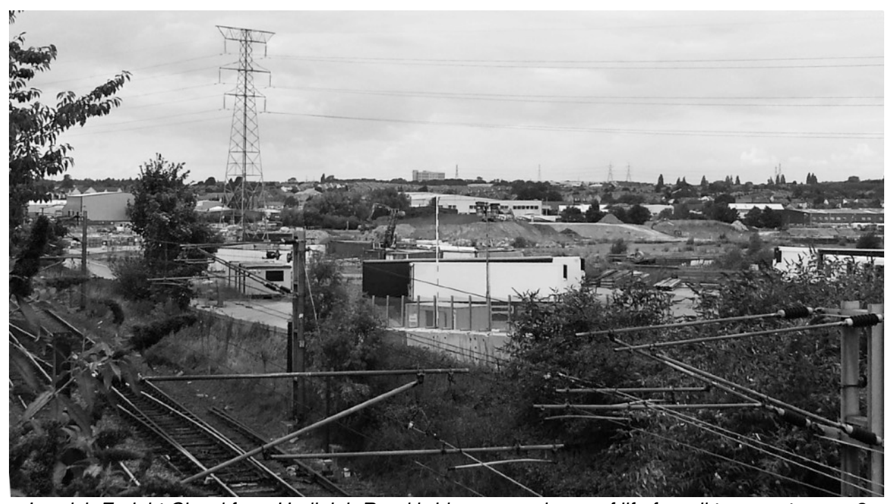
Ipswich Freight Chord from Hadleigh Road bridge: a new lease of life for rail transport, page 3