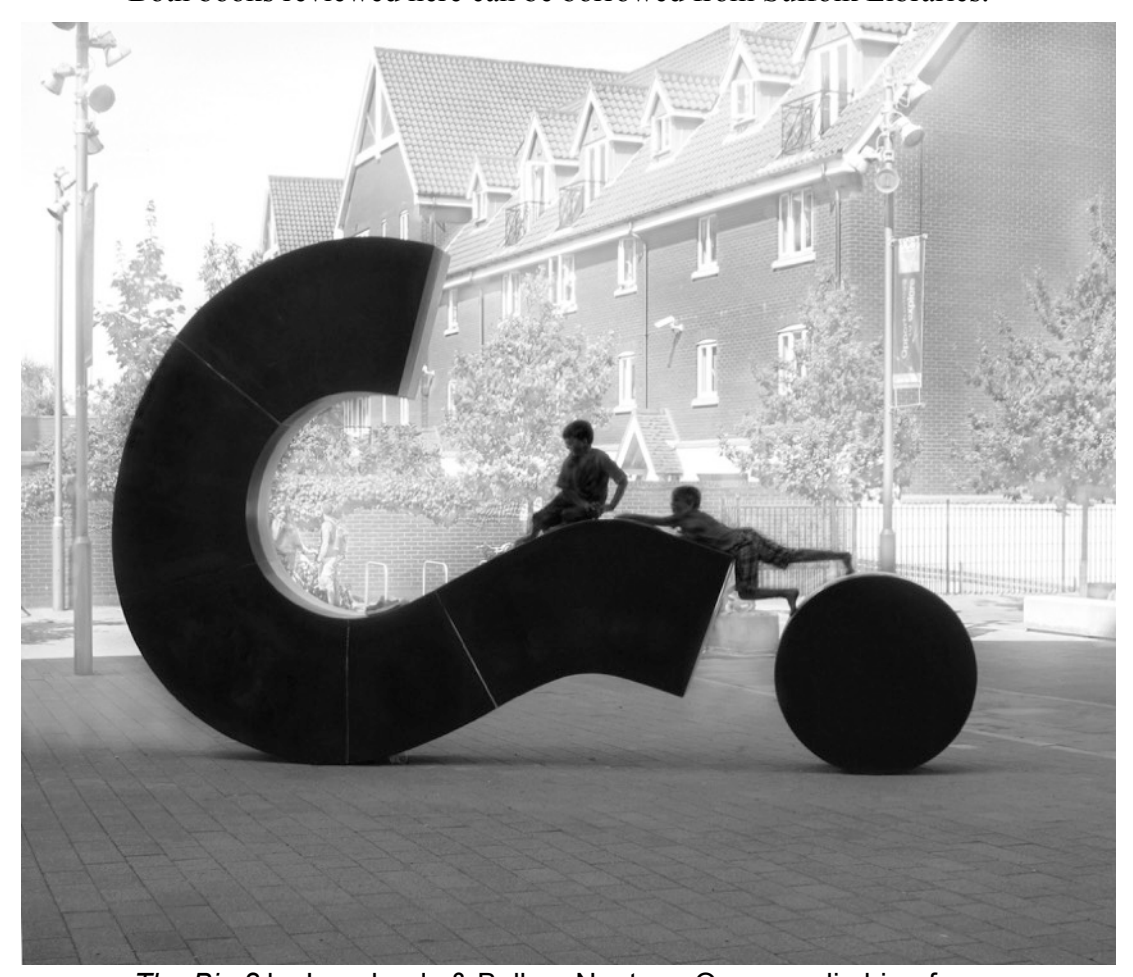
The Big? by Langlands & Bell on Neptune Quay as climbing frame

Both books reviewed here can be borrowed from Suffolk Libraries.